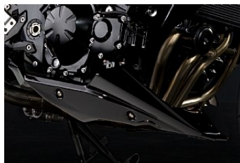
BELLY PAN (Z750.) £ 270.95