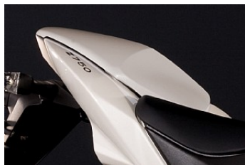
PILLION SEAT COVER £ 142.95