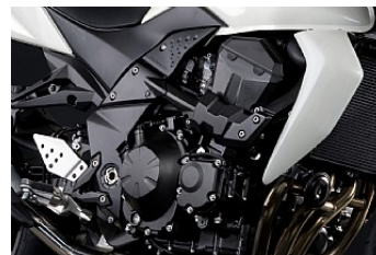
748cc supersports tuned engine