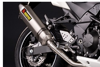
AKRAPOVIC EXHAUST* as from £ 704.95